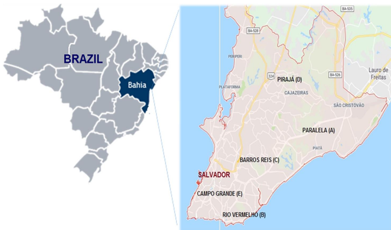
Figure S1. Sampling sites in the city of Salvador.

a Departamento de Química Analítica, Instituto de Química, Universidade Federal da Bahia, 40170-115 Salvador-BA, Brazil